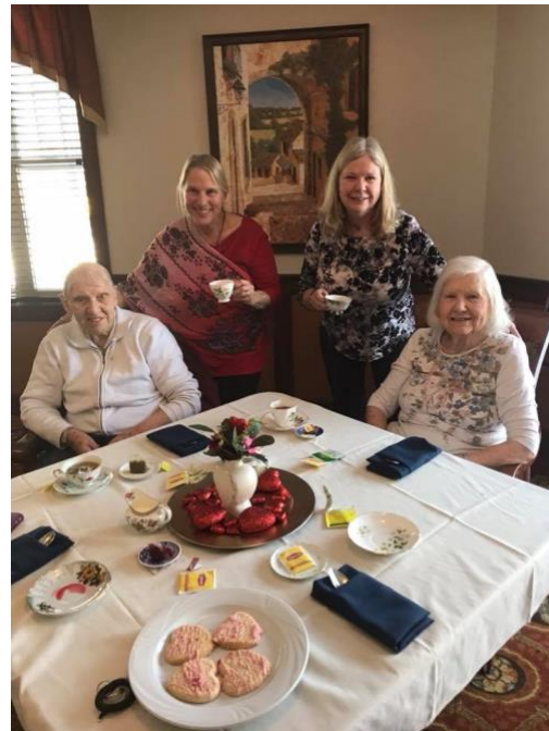
Valentine's Day Tea Party!