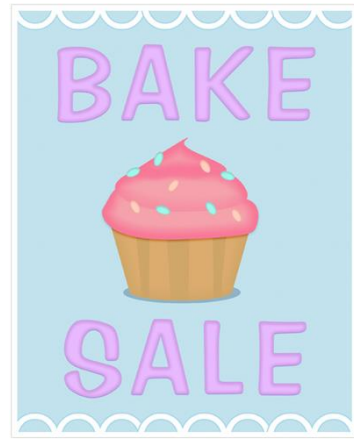
The Sunshine Club Bake Sale is coming up in May!