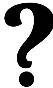
Can you guess which resident this is?