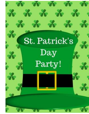
We had a great St. Patrick's Day Party with yummy food and drinks! Family and friends joined as well.

The answer can be found under the Notable Extras section on page 4.