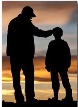
A Mother's Day sermon inspired Sonora Smart Dodd to invent Father's Day.

Fathers really should thank mothers for the creation of Father's Day. It was a woman named Sonora Smart Dodd, one of six children raised by her widower father, who lobbied to create a father's equivalent to the popular Mother's Day. Dodd took her cause to churches, shopkeepers, the YMCA, and local government officials until finally, on June 19, 1910, Washington state celebrated the first Father's Day. Over the years, the holiday gained traction, and in 1924, President Calvin Coolidge urged all states to adopt